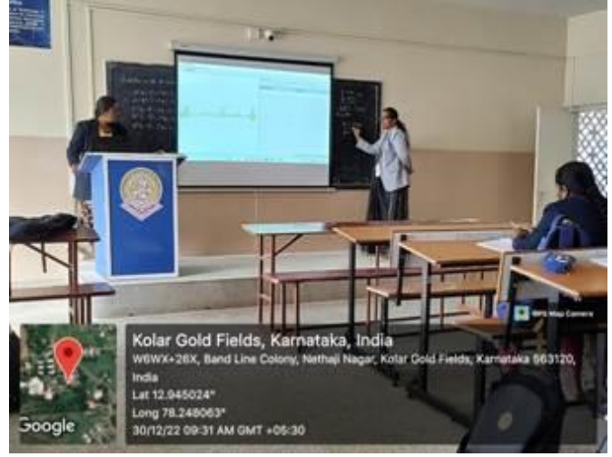
Figure2:Jflap Software presentation