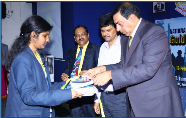
Release of Proceedings during the National Seminar