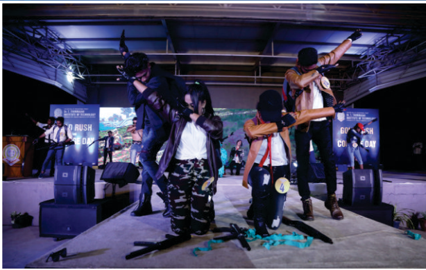
PHOTO GALLERY GOLD RUSH - 2019