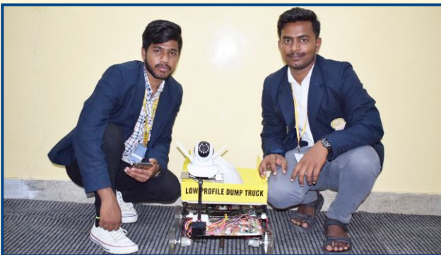
Mechanical students with their model of vacuum cleaner and dryer