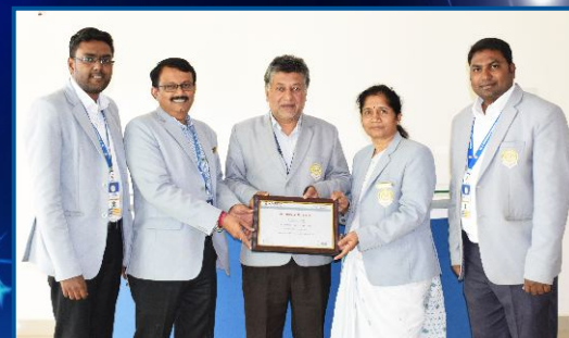
"Rising Star" awarded to Dr.TTIT by CISCO Networking Academy for the year 2018

Dr.TTIT CISCO Networking academy received the "Rising Star" award for the year 2018 at the international conference CISCO India held on 11th and 12th February 2019 at Bangalore.