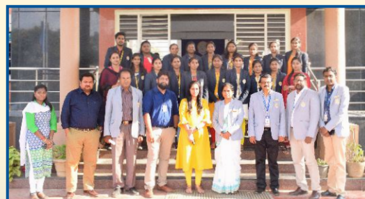
Students placed in TalTech Solutions Pvt Ltd.