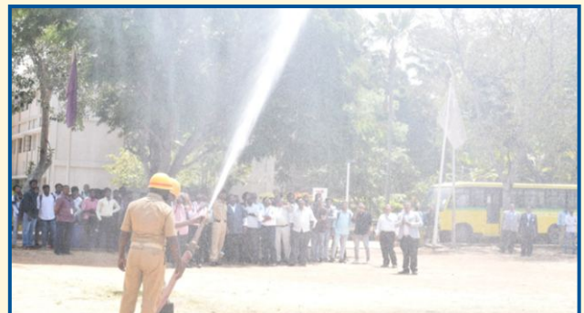
Demonstration of rescue from fire accidents