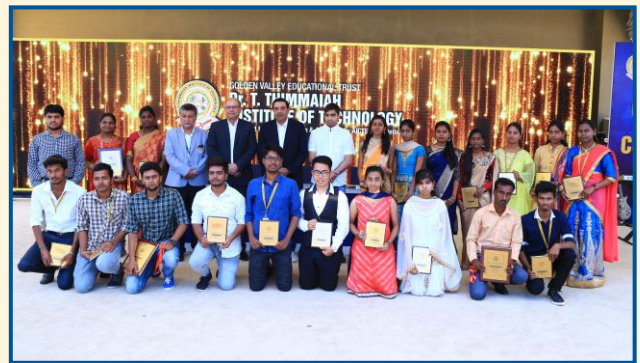
Annual class toppers with the chief guest and dignitaries