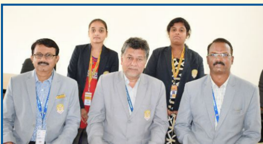
Students placed in Accord Company