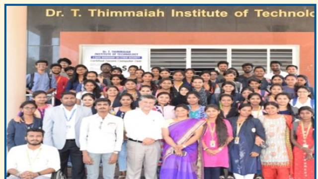
Students, Principal, Faculty Members, Trainers during the workshop