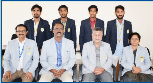
Students placed in Westline Company

Department of Training and Placements has provided more than 200 opportunities for the batch 2018-19 students and more than 100 offer letters were given to the students. The eminent recruiters are Westline Shipping company, Accord,Taltech, Eduvirtuoso, Westron company,Aradhya's Brilliance Centre Pvt. Ltd,Technologies Global Pvt. Ltd