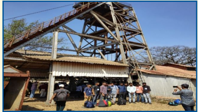
Students during the Henry's shaft mines visit