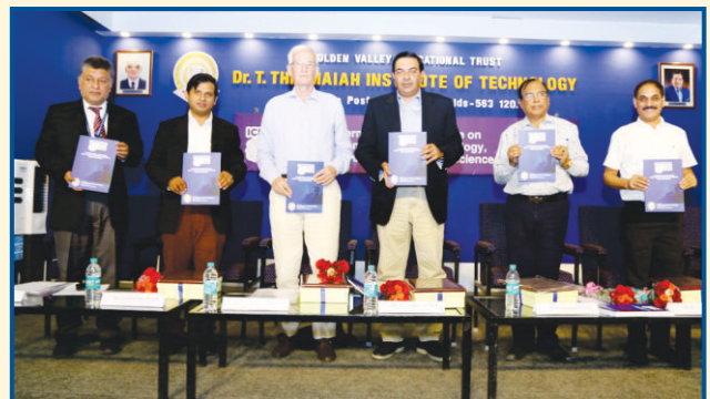
Releasing of Proceedings during First International Conference