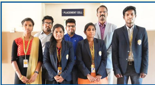
Students placed in Technologies Global Pvt. Ltd