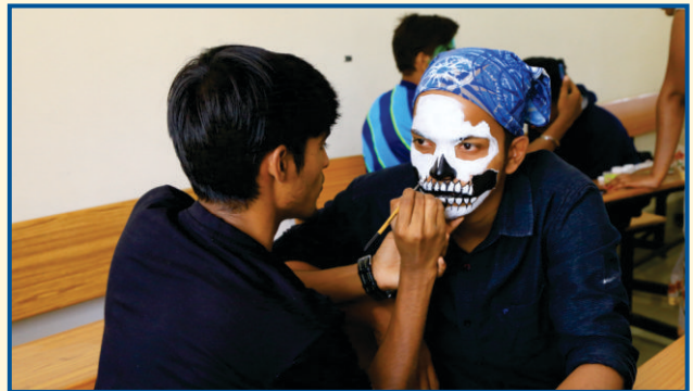
During the Face painting competition