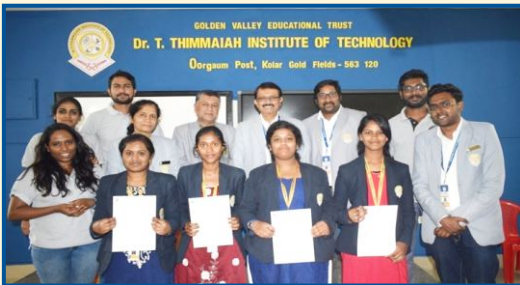
Students placed in Aradhya's Brilliance Centre (ABC) Pvt. Ltd. Bangalore.