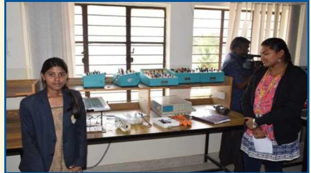
EEE students with their project model