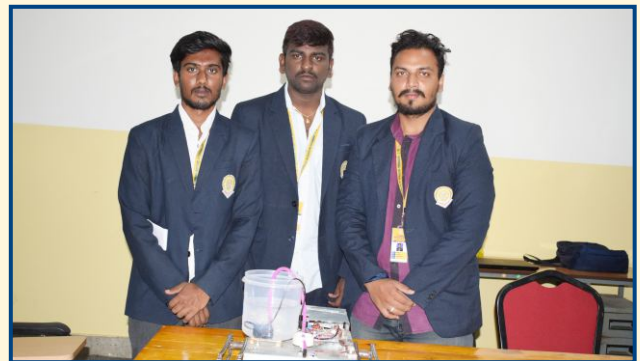
Mining Students with their model