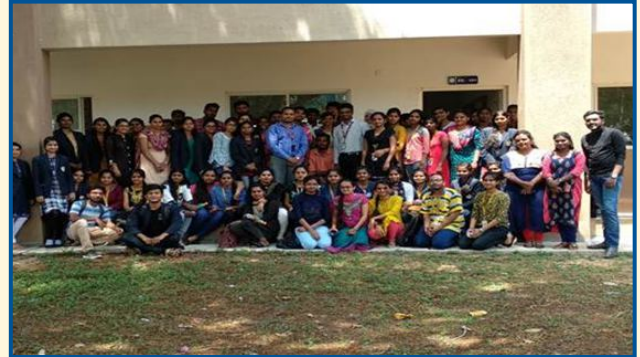
Students and Trainers during the FACE Training Session

Two Weeks Job Readiness sessions training was conducted in association with FACE Academy, for Pre-Final year students.