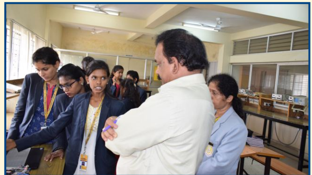
ECE students exhibiting their projects