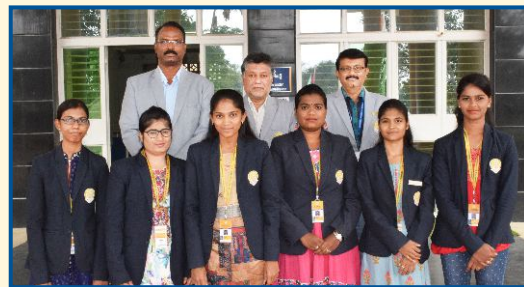
Students placed in Eduvirtuoso