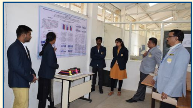
Civil engineering students demonstrating their project