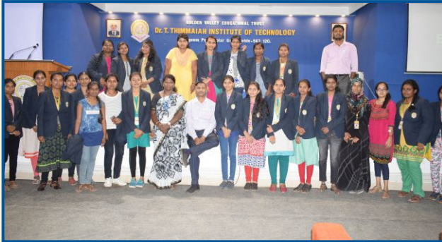
Students with resource person during Entrepreneurship Workshop