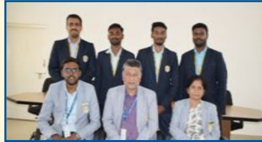
Students placed in Westline Company