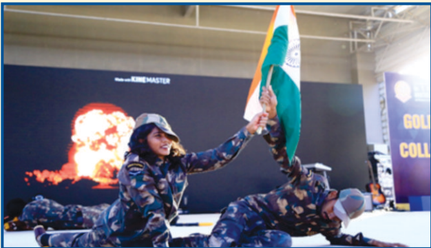
During the Skit

multifarious fields. Various competitions like Rangoli, face painting, singing ,dance, mehandi , fashion show etc., were conducted with the fabulous DJ show.