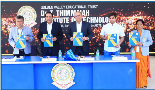
Release of newsletter on College day by the dignitaries

During the function, the annual class toppers, the Sports achievers and VTU Rank holders were awarded.