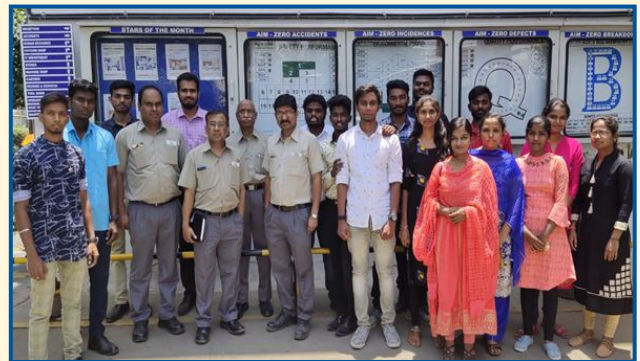
Students and faculty members during the visit to Ms. Bill Forge Private Limited ,Bangalore