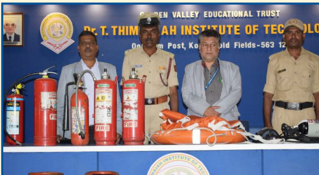
Principal along with fire and rescue team personnel

Fire Safety awareness program was conducted by Karnataka state fire and emergency services, K.G.F on 29/03/2019 for the students, faculty and non teaching Staff of our college in students centre.