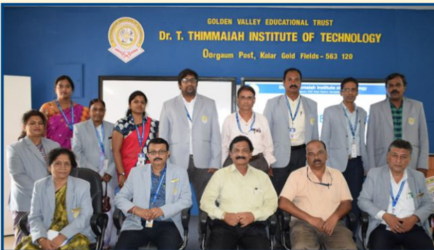
Principal, HODs with the judges of project exhibition