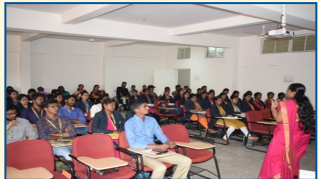
A Session in progress during the workshop