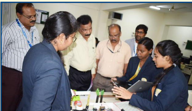
Judges evaluating in Computer science department