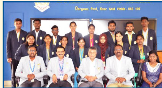
Students placed in Westron Company