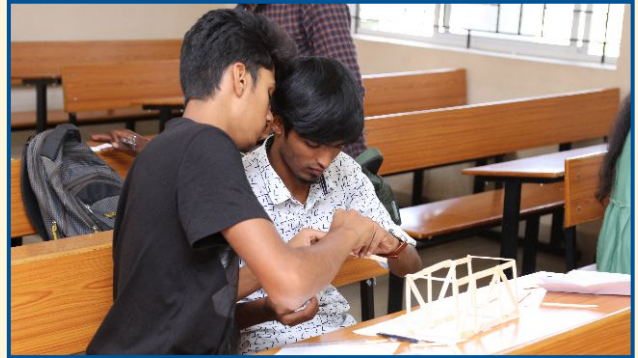
Students Participating in Techno Rush activities